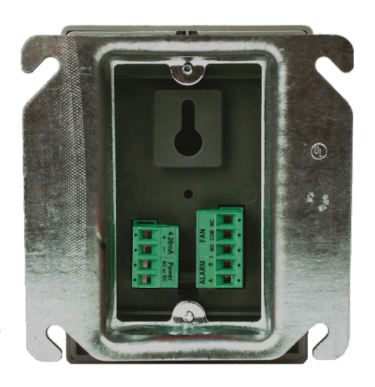
CM-6 Rear View

© Aerionics 2012. All rights reserved. Macurco is a trademark of Aerionics, Inc.